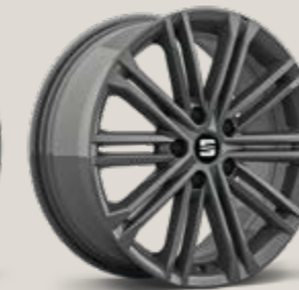
Dynamic 30/1 XE