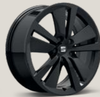
Black R St FR