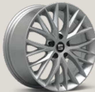
Dynamic 30/3 St