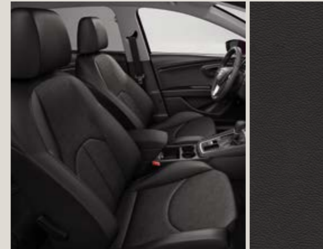
Alcantara® Black Sport seats DE + WL3'