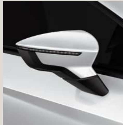
Nevada White 2 R St XE FR XP CU