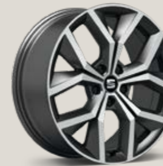
Performance Machined Atom Grey XP