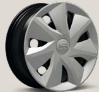
Urban 30/1 R