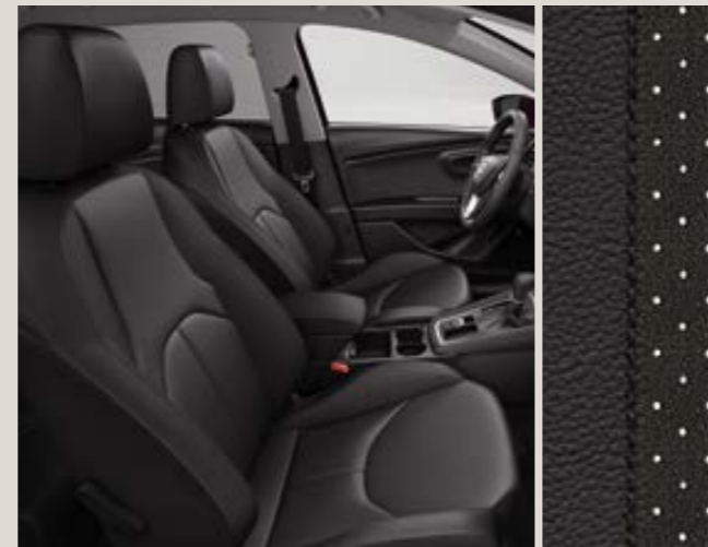
Leather Black Sport seats DE + WL1