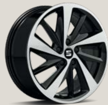
Black Machined R St FR