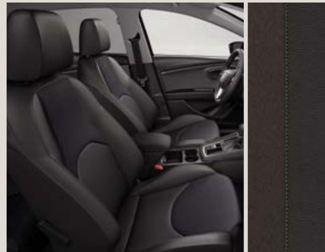
Cloth Teddy/Mikelly Sport seats DE