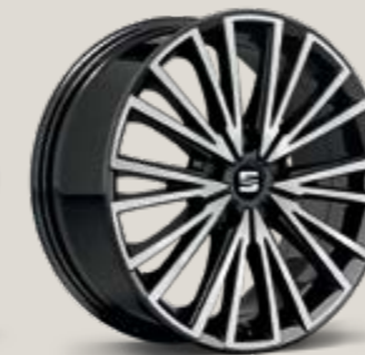
Dynamic 30/4 Black High Gloss XE