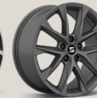
Performance Machined Atom Grey XP