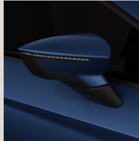
Mediterraneo Blue 1 R St XE FR XP CU