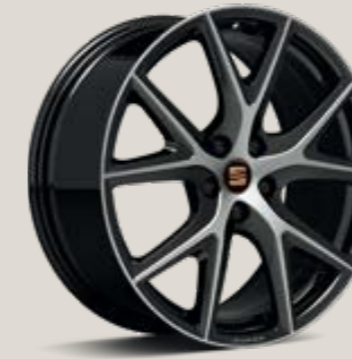
Machined Silver CU