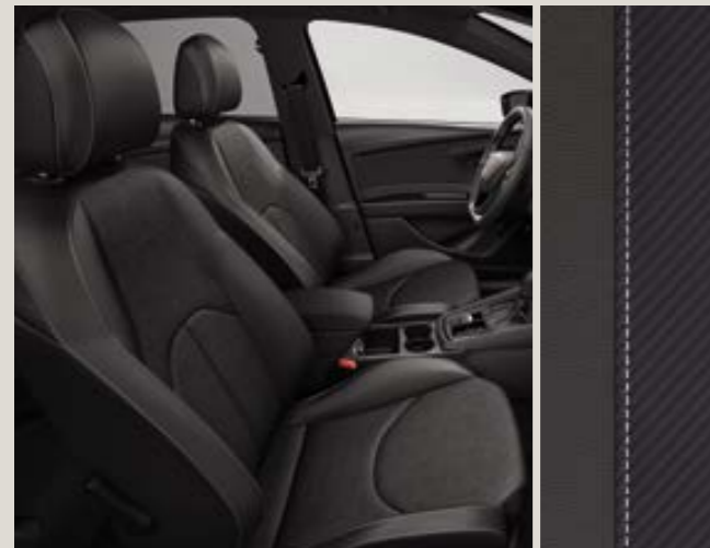
Alcantara® Black Sport seats LE 1