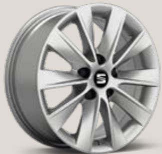
Design 30/2 St