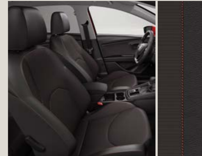
Cloth Techny Black Sport seats GE