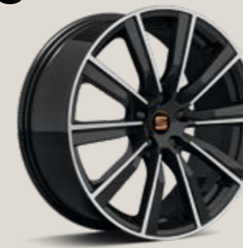
Machined Black CU