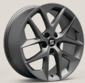
Titanium Grey R St FR