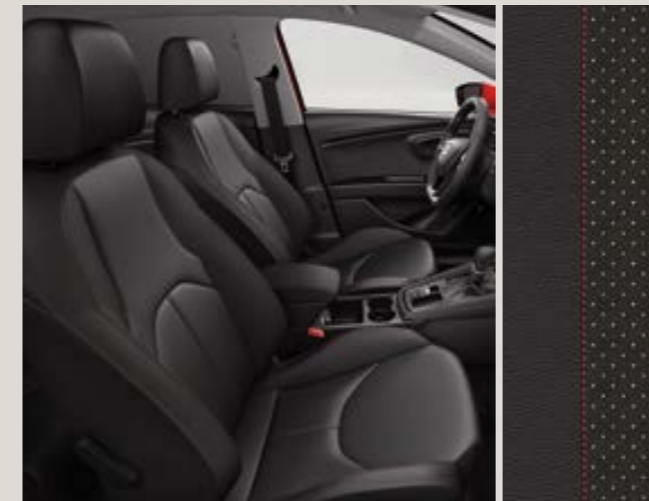
Leather Black Sport seats GE + WL1