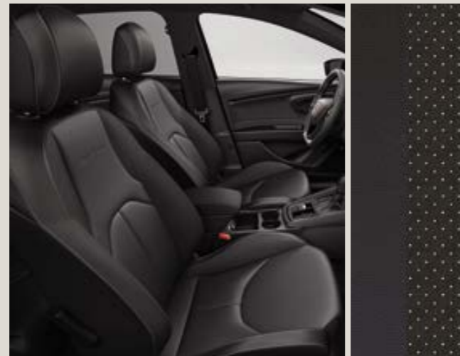
Leather Black Sport seats LE + WL1