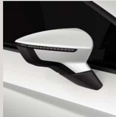
White 1 R St XE FR XP