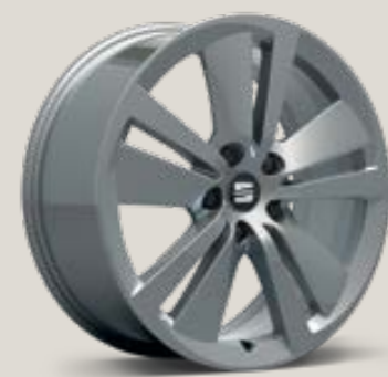
Anthracite R St FR