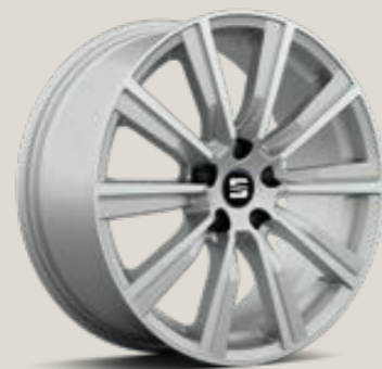
CupRacer Grey R St FR