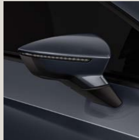
Magnetic Tech 2 R St XE FR XP CU