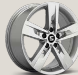
Dynamic 30/2 FR