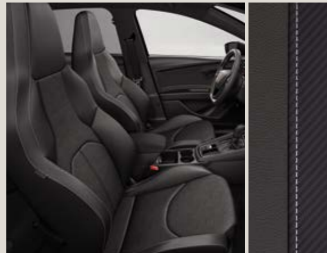
Bucket seats LE+PL6