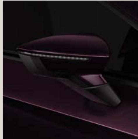
Boheme Purple 2 R St XE FR