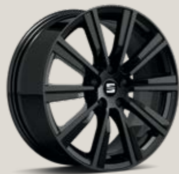
CupRacer Black R St FR