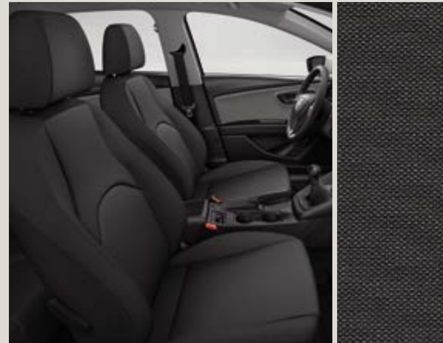
Cloth Coffeeblack Comfort seats AE