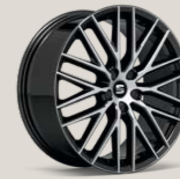
Black Performance FR CU

Reference R Style St Xcellence XE FR FR X-PERIENCE XP CUPRA CU Standard ■ Optional ■