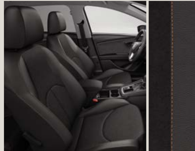
Alcantara® Black Sport seats AD + WL3 1