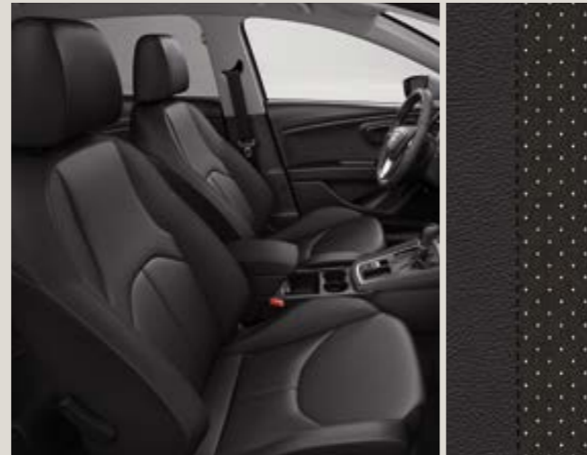
Leather Black Sport seats AD + WL1