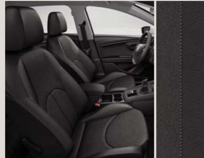
Alcantara® Black Sport seats CE + WL3'