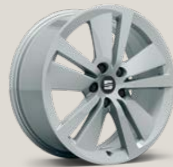
Dynamic Grey R St FR