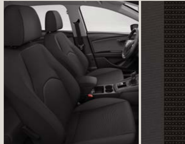
Cloth Tresil Comfort seats CE