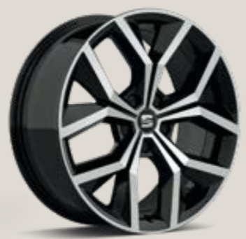
Black X-PERIENCE XP