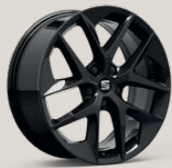
Black R St FR