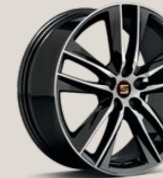
CUPRA 30/2 Black High Gloss CU

Reference R Style St Xcellence XE FR FR X-PERIENCE XP CUPRA CU Standard St Optional Op