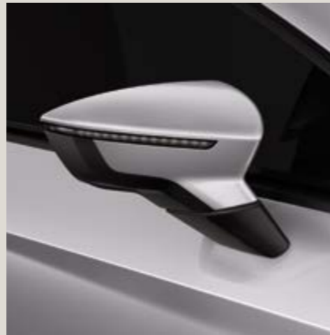
Urban Silver 2 R St XE FR XP CU