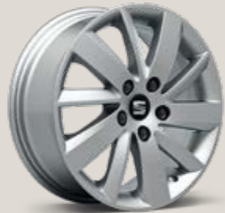
Design 30/1 R