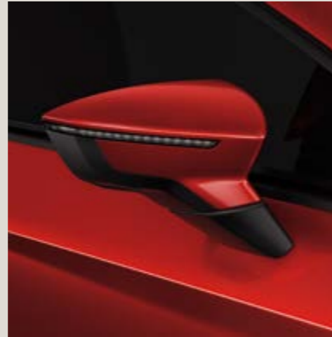
Desire Red 2 R St XE FR CU