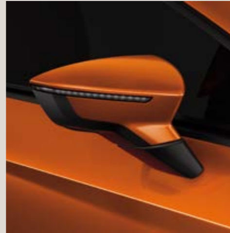
Eclipse Orange 2 R St XE FR XP