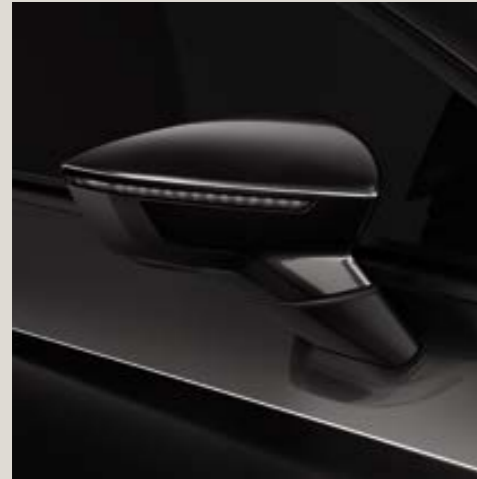
Midnight Black 2 R St XE FR XP CU