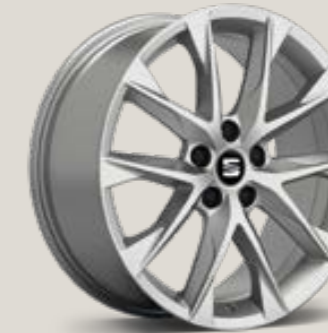
Performance 30/1 FR