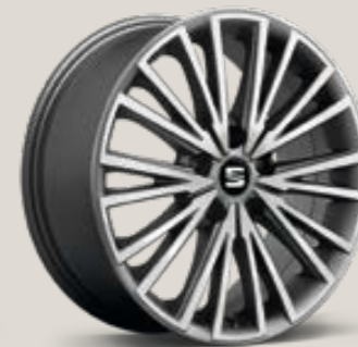
Dynamic 30/4 Atom Grey St