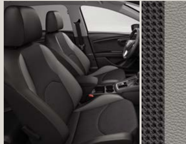
Cloth Germe Sport seats AD