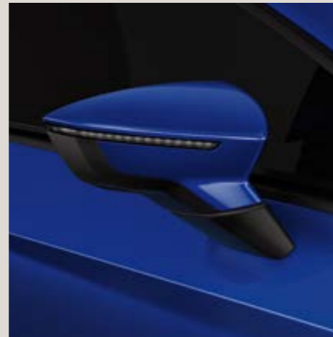
Mystery Blue 2 R St XE FR CU