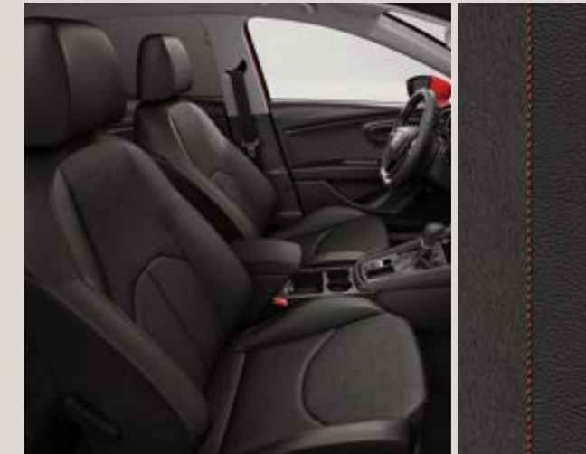
Alcantara® Black Sport seats GE + WL3'