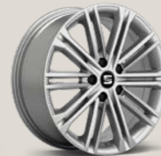
Dynamic 30/1 XE