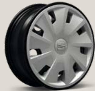
Urban 30/1 R