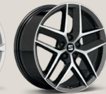
Performance 30/2 Machined FR